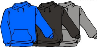
Hoodie Sweatshirt (Royal, Black, Grey)