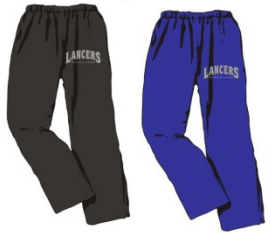
Open Bottom Sweatpant (Royal, Black)