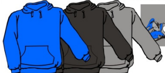
Hoodie Sweatshirt (Royal, Black, Grey)