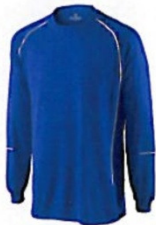
Rival Raglan long sleeve w/white trim (Royal and White) ROYAL