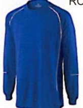
Rival Raglan long sleeve w/white trim (Royal and White) ROYAL