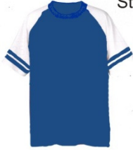
Sleeve Strip Six-Ounce Jersey (Royal and White) Style 650