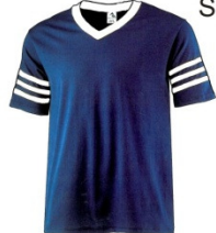
Sleeve Strip Six-Ounce Jersey (Royal and White) Style 351