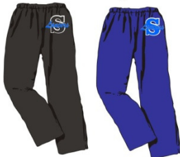
Open Bottom Sweatpant (Royal, Black)