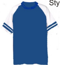
Sleeve Strip Six-Ounce Jersey (Royal and White) Style 650