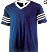
Sleeve Strip Six-Ounce Jersey (Royal and White) Style 351